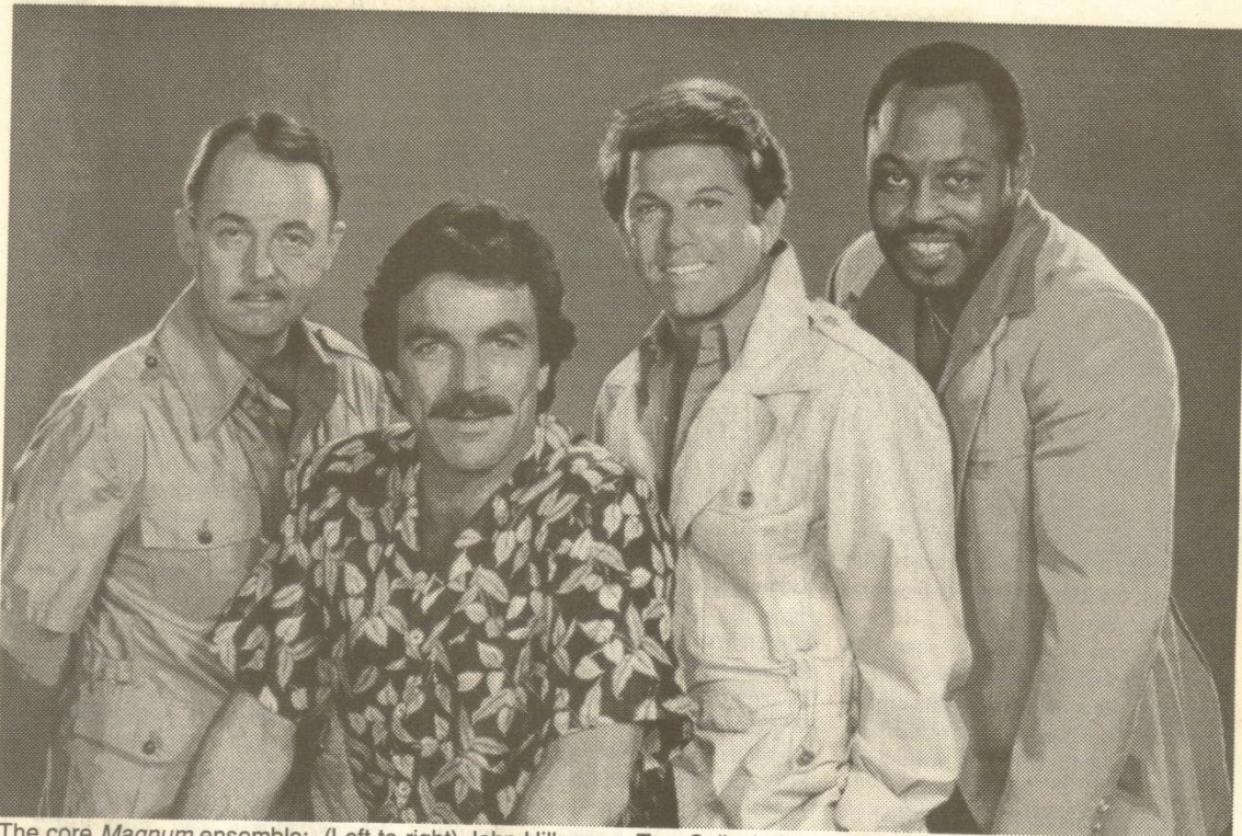
The core Magnum ensemble: (Left to right) John Hillerman, Tom Selleck, Larry Manetti, and Roger E. Mosley.

many became series, including: Ironside , Prescription: Murder ( Columbo ), Then Came Bronson , Dragnet , The D.A.: Murder One , McCloud: Who Killed Miss U.S.A.? , Dial Hot Line ( Matt Lincoln ), Alias Smith and Jones , and O'Hara, United States Treasury: Operation Cobra .