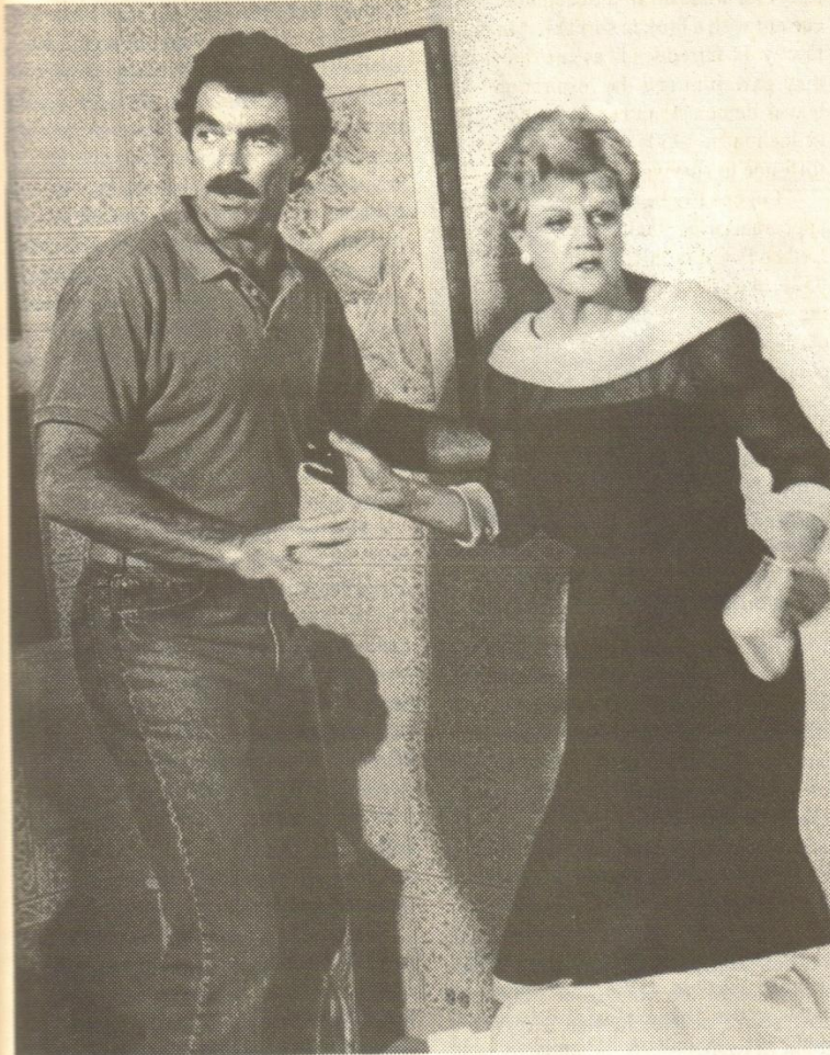
Two of television's most eminent detectives join forces as Jessica Fletcher lends Magnum a hand in the crossover episode NOVEL CONNECTION, the resolution of which came in Murder, She Wrote's MAGNUM ON ICE episode.

Francesca Annis, gave this show a lot of class.