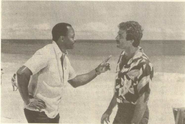
T.C. makes a point.

Magnum's voice-overs were a wonderful gimmick lifted from the 1930s detective films. They often began, "I know what you're thinking..." It worked beautifully because it let us know what he was thinking and involved us in the process. It made it possible for us to learn about his family and childhood, what he really felt about Vietnam, and what he'd say if he was writing a book on