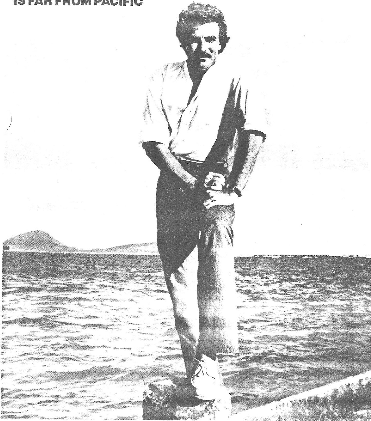
Thanks to his hit series, Selleck is as much an attraction as Diamond Head, but marital woes have shaken his rock-solid steadiness.