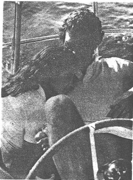
Deep-sixed by his wife in Divorce Wars , Selleck finds solace with co-star Mimi Rogers. They've dated offscreen, too.